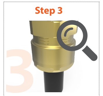
The backnut should be level with the marking guide corresponding to its diameter – this can be visually inspected and adjusted as necessary