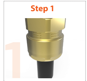
Follow cable gland installation instructions until final stage – tightening of rear seal

The gland is permanently marked with various lines/numbers indicating the correct tightening level related to the cable diameter. Following the relevant cable gland Installation Instructions, the back seal should be tightened until a seal is formed on the cable outer sheath and then tightened one further turn.