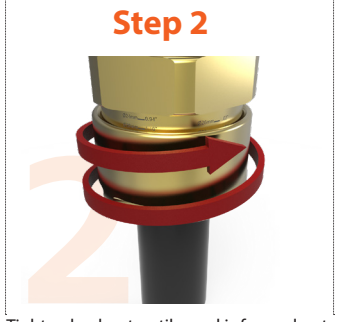
Tighten backnut until a seal is formed onto the cable, then tighten one further turn