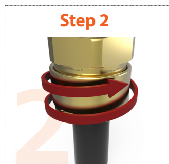
Step 2 Tighten backnut until a seal is formed onto the cable, then tighten one further turn