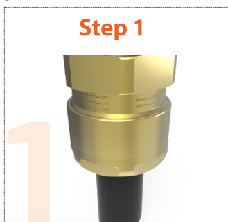
Step 1 Follow cable gland installation instructions until final stage – tightening of rear seal

The gland is permanently marked with various lines/numbers indicating the correct tightening level related to the cable diameter. Following the relevant cable gland Installation Instructions, the back seal should be tightened until a seal is formed on the cable outer sheath and then tightened one further turn.