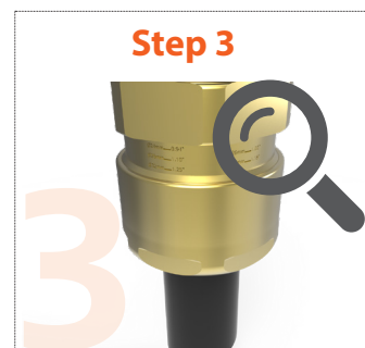
Step 3 The backnut should be level with the marking guide corresponding to its diameter – this can be visually inspected and adjusted as necessary

Note: The cable gland installation instructions have a printed cable OD measure for if the cable OD is not known